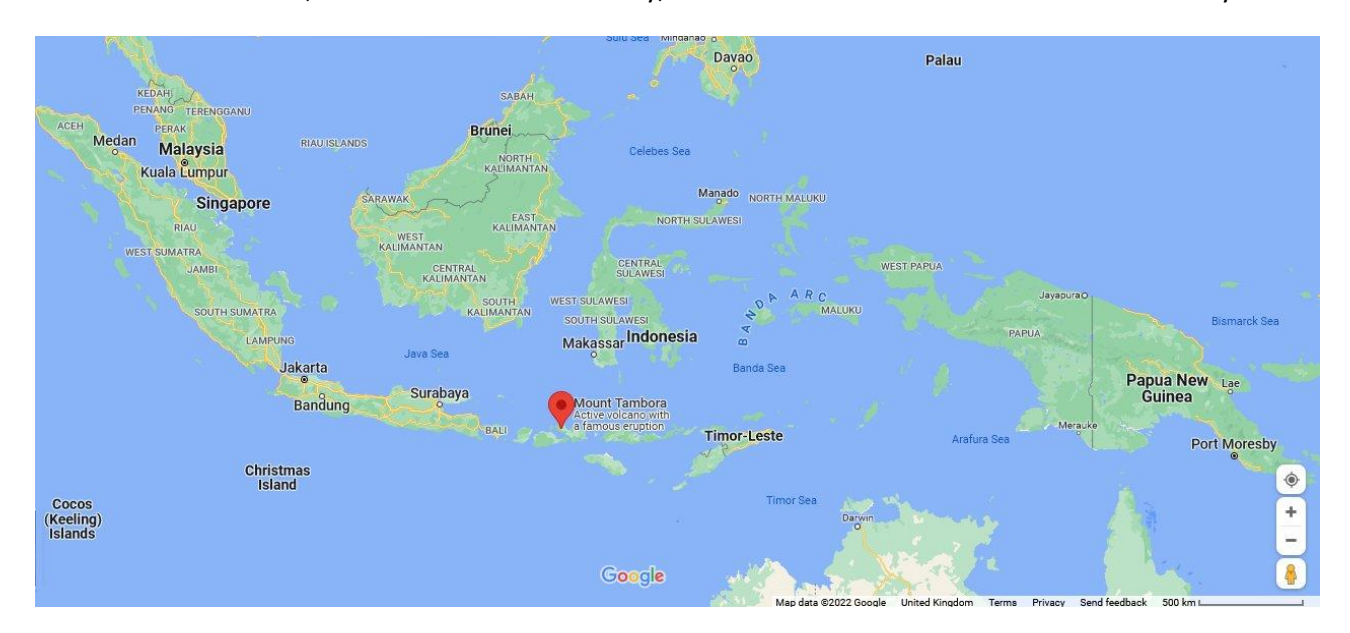
Indonesian archipelago, showing the site of Mount Tambora

Both groups were wrong. What they were hearing was the re-awakening of Mount Tambora, a volcano on the island of Sumbawa, about 1000 kilometres away, which had been dormant for several hundred years.