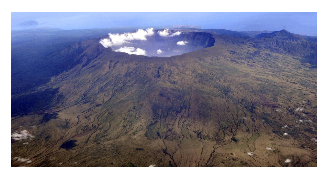
The caldera of Mount Tambora

The eruption was the largest and most devastating observed in recorded history. 150 cubic kilometres of material was ejected in just a few days – enough to cover the whole of Britain up to knee-deep in volcanic dust and rock. All life in a radius of 20km from Tambora was eradicated and solid material settled across Indonesia.